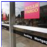
New York Daily News

Texas AG Abbott's Agreement With Wells Fargo Results in Mortgage Relief for ... - National Mortgage Professional Magazine